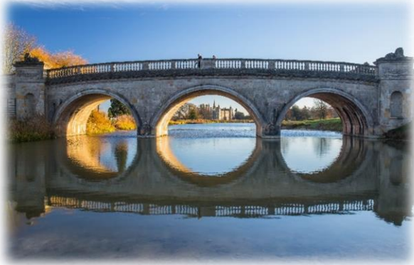
Elsing Hall Gardens and Blickling Estate House and Garden.

We will be staying in the Wensum Valley Hotel, Golf and Country Club near Norwich, with visits to Sandringham House, Holkham Walled Garden, East Ruston Old Vicarage, Felbrigg Hall and Gardens,