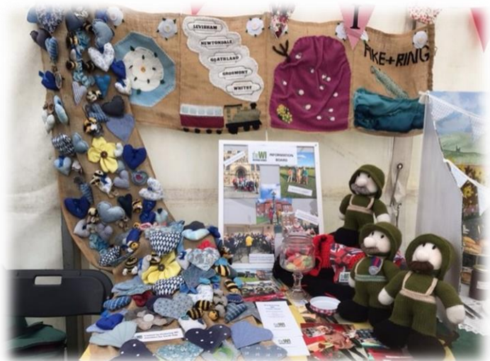
Pickering WI table at the show