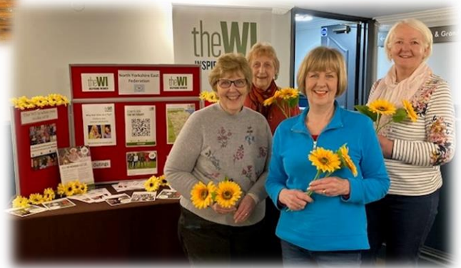
Membership & Training Committee members at the ready with their Sunflowers!